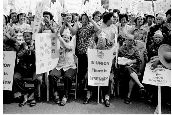
Union: an organization of workers formed to protect their rights.