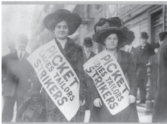
Strike: when workers stop working and ask an employer to change their workplace.