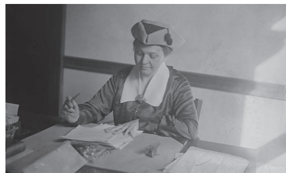
Reformer: a person who works to improve a government or society (pictured: Frances Perkins).