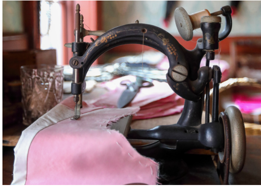
Sewing machine: a device used to construct clothes more quickly.