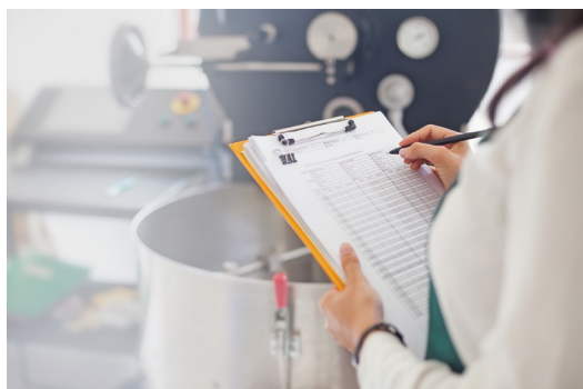
Inspection: an official visit to check conditions in a workplace.